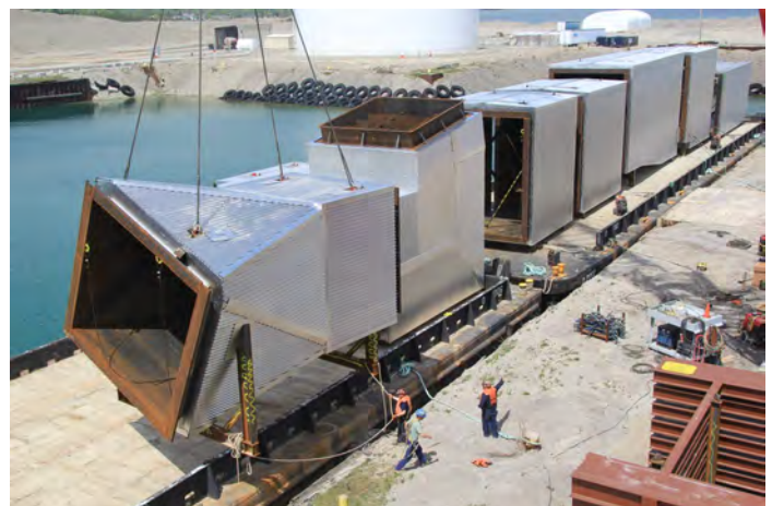
Above: Loading the barge for customer delivery