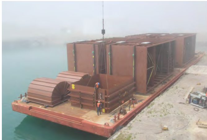
Above: Final barge load that was delivered to the customer's site.

Moran Iron Works completed a large pulse jet fabric filter system; the project began January 2012 and the last barge pulled out of port and headed for our customers plant in July 2013.