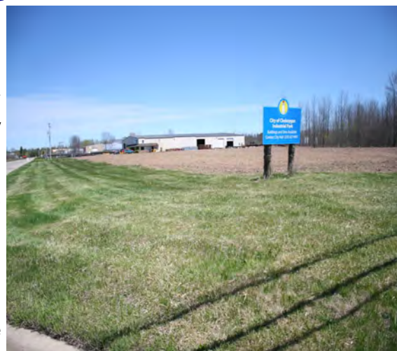
Above: Moran Iron Works North Facility