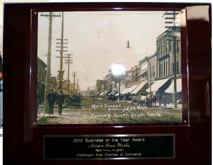
Below: Business of the Year Award received by MIW North from Cheboygan Area Chamber of Commerce