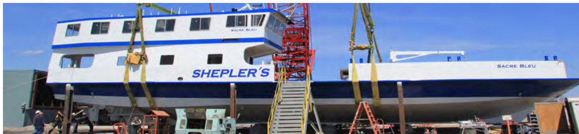
Above: Shepler's Ship, Sacre Bleu