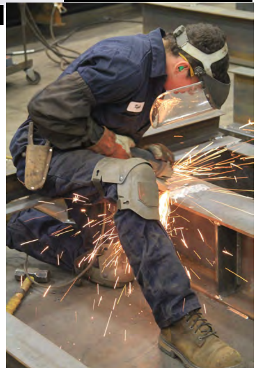
Below: Working on SCR Ductwork

P.O. Box 732 11739 M-68/33 Onaway, MI 49765 Phone: 989-733-2011 Fax: 989-733-2371