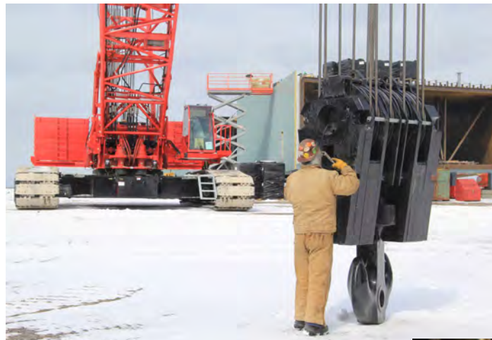
Above: The Manitowoc 16,000 during assembly

The Manitowoc is currently configured to lift 881,900 pounds, but has the capability of lifting greater weights. This fleet addition will allow for greater ease in the handling of larger components at the deep water port.