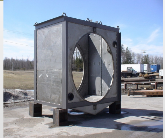
Frame 5 Fabricated Plenum 2006

everything installed during April 2011. We have worked at peaker plants like this in the past and have such vast experience that we are able to maintain the main parts in stock.